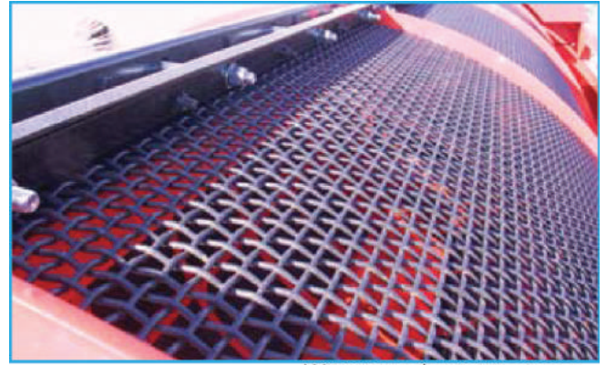
Woven mesh rotary screens

Special items not in stock will be promptly manufactured to your requirements.