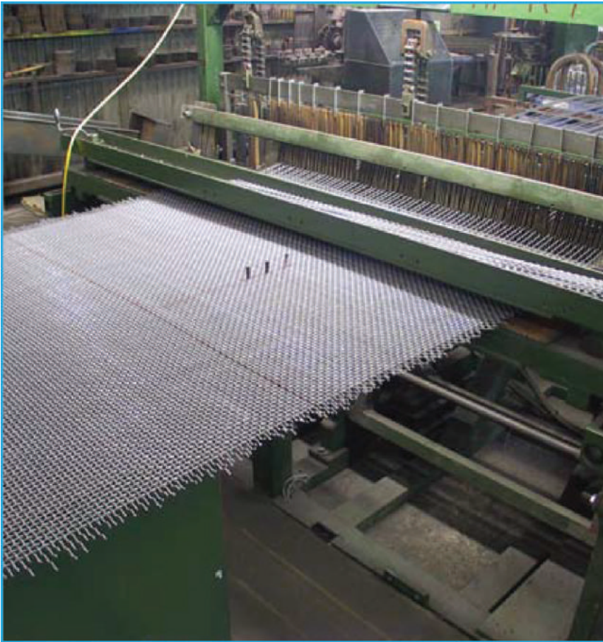
Wire weaving machine in operation