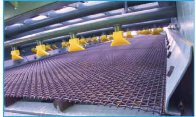
Standard hooked high tensile woven wire screen

These screens can be supplied with raw edges, hooked or curved into Trommel-type rotary screens.